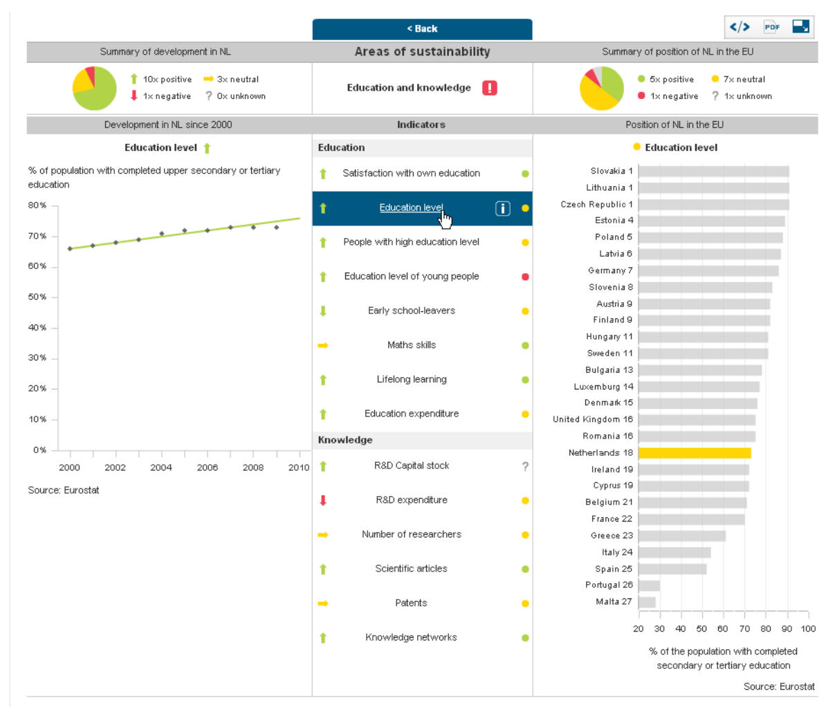
Figure 3. Visualisation- The Netherlands (Indicator details)