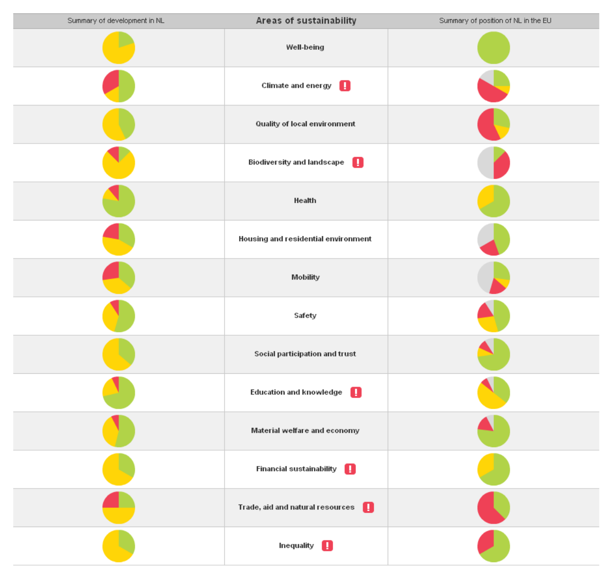
Figure 2. Visualisation- The Netherlands (Thematic categorisation)