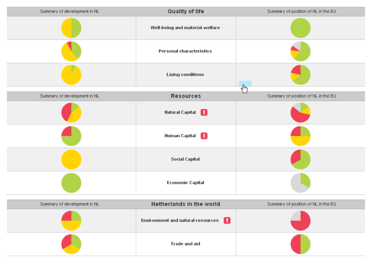
Figure 1. Visualisation- The Netherlands (Conceptual categorisation)